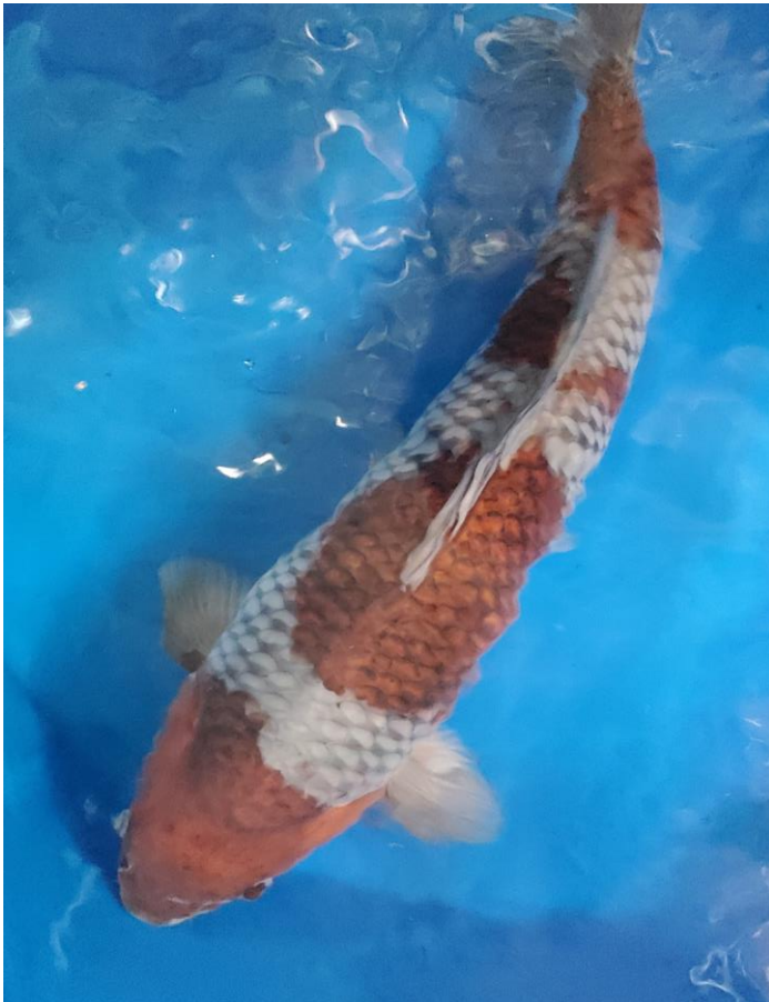
Winner – Goshiki Length: 24 inches