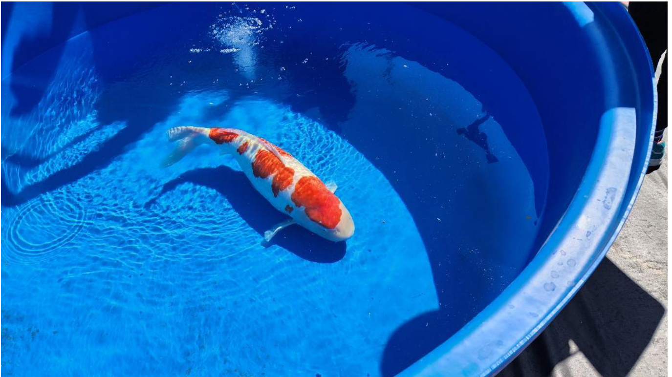
All American Koi Size 9 Champion 2025 [Kohaku – 36 inches +/- size in length]