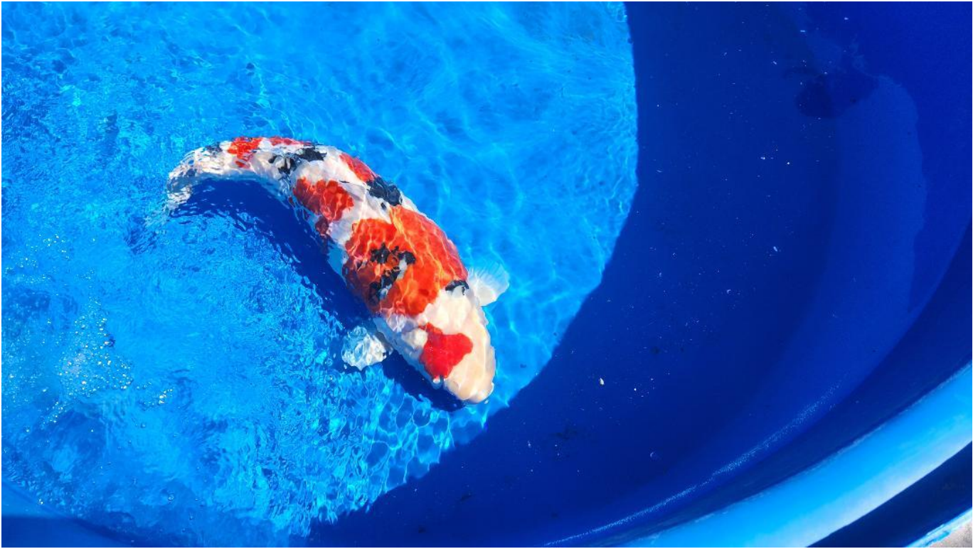
All American Koi Reserve Champion 2025 [Sanke– 36 inches +/- size in length]