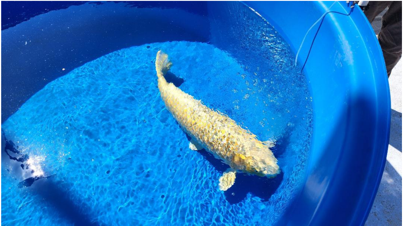
All American Koi Reserve Size 9 Champion 2025 [Yamabuki – 36 inches +/- size in length]