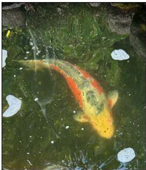
Winner - Asagi

Each year it is our club's tradition to select a Koi of the Year from our membership. This year's entries were received an award and acknowledgement for representing the club's Koi of the Year.