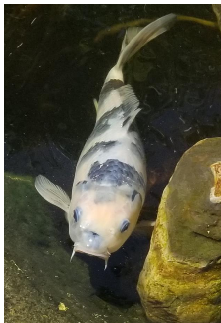
Runner up - Utsuri