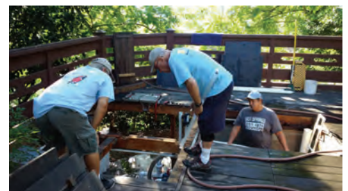
Helloooo down there