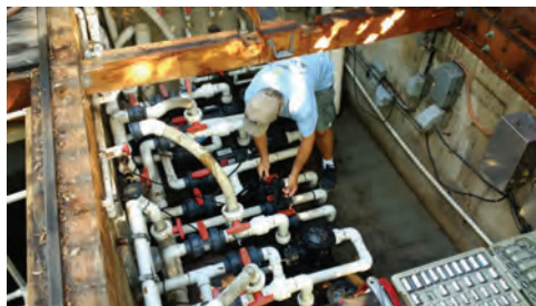
Was that open, close ,open or close ,open ,close?