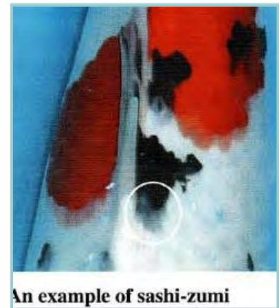
An example of sashi-zumi