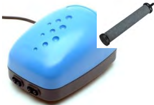
Airpump with air stone