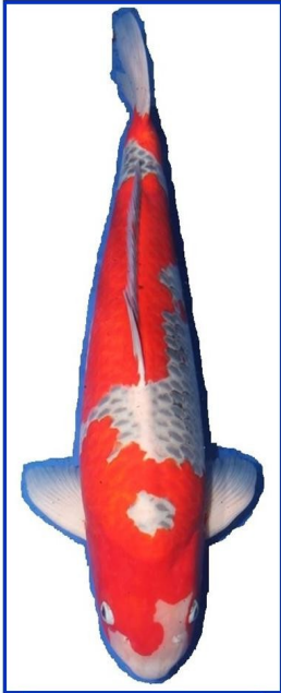
2014 Grand Champion

Saturday and Sunday September 26 & 27, 2015 Fig Garden Village 5082 N. Palm Ave, Palm & Shaw, Fresno, California