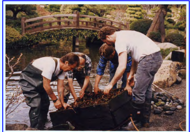
Club Members Workng at Hakone 3/92