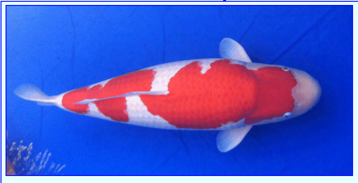
84 cm (33") Kohaku