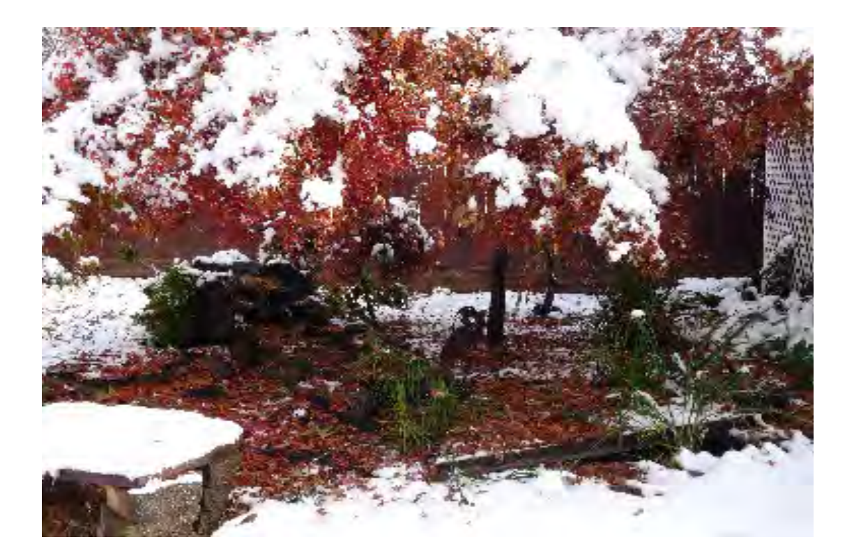
Eda Eggeman's pond in Redding