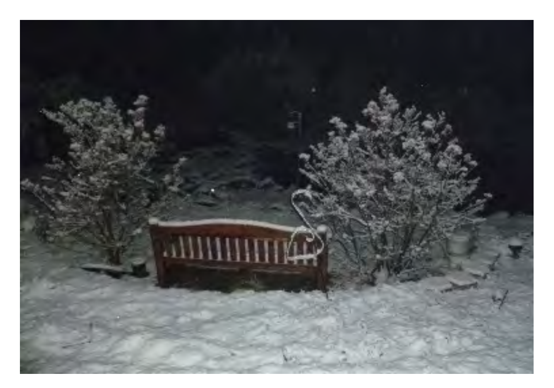
Connie & Ross Salazar's pond in Cottonwood